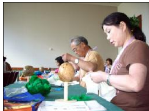
Uli Uli class from 2007