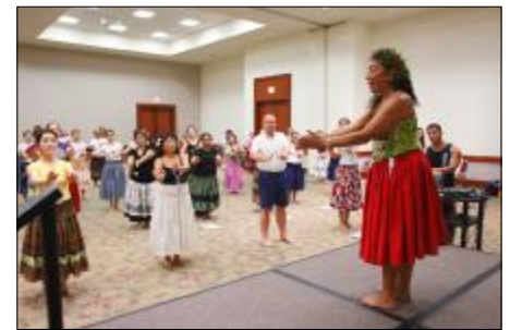
Hula class from 2007