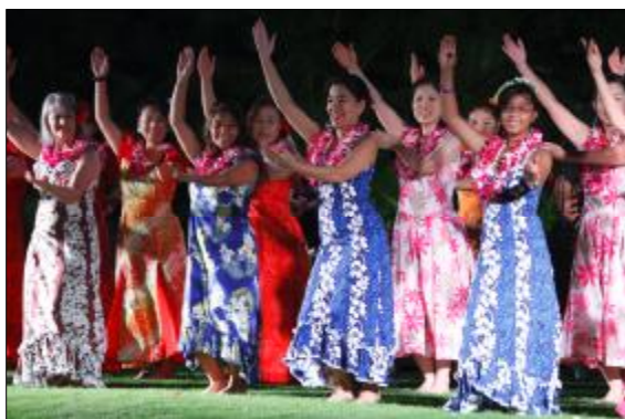
Ho`ike from 2007