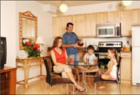
Aston Waikiki Banyan