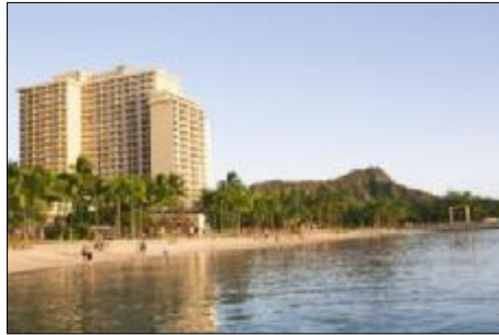
Aston Waikiki Beach