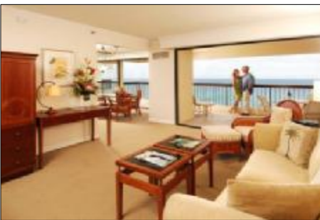
Aston Waikiki Beach Tower