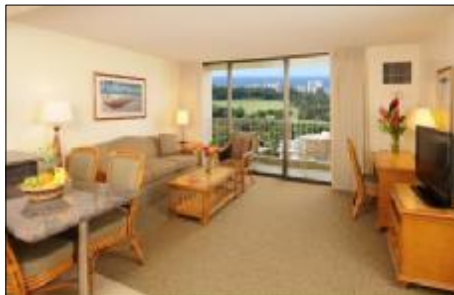
Aston Waikiki Sunset