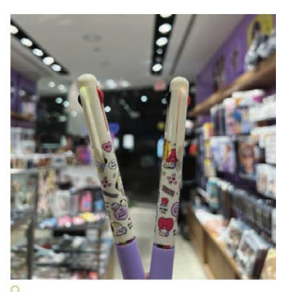
K-pop Friends BT21 multi-pens