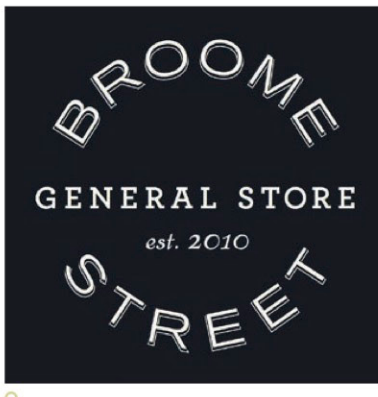
Broome St. General will open at the Royal Hawaiian Center in August.