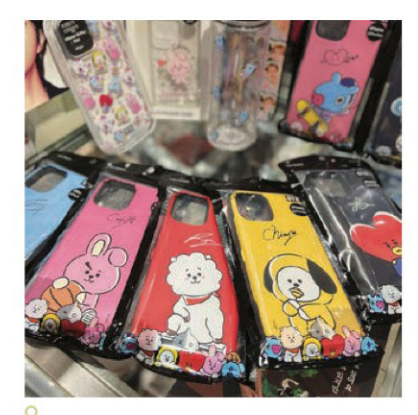
K-pop Friends BT21 phone cases

For updates on new stores and restaurants, follow us on social media (@royalhwnctr) or visit our website at www.royalhawaiiancenter.com/events.