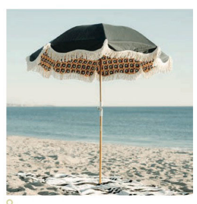
Premium Beach Umbrella, Bottle Green