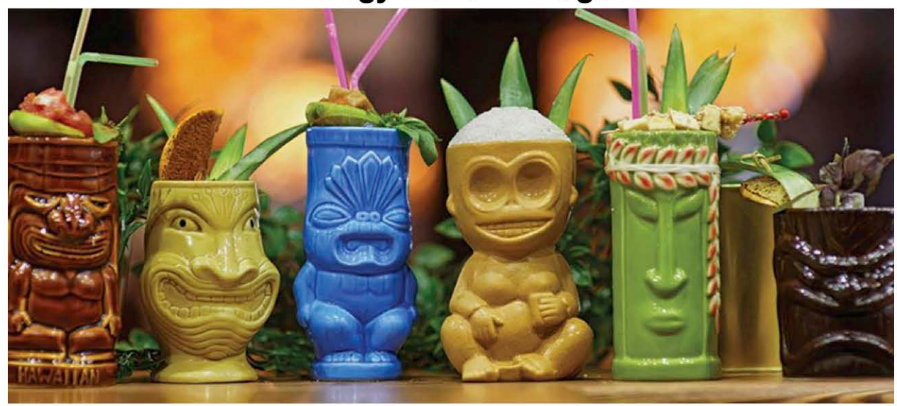
Annual Celebration of "Cocktail Culture" includes Tiki-versary, Battle of the Bartenders, a Don Ho Tribute and more

In a grand celebration of "cocktail culture," International Market Place and its collection of popular shops, eateries and chef-driven restaurants will welcome diners to Mixology Month in August. The month-long celebration is the perfect way for residents and visitors experience to specially priced cocktails and appetizers at participating restaurants throughout the month of August.