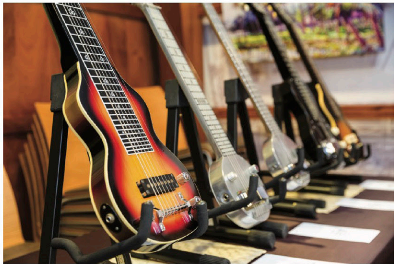
Steel Guitar Exhibit