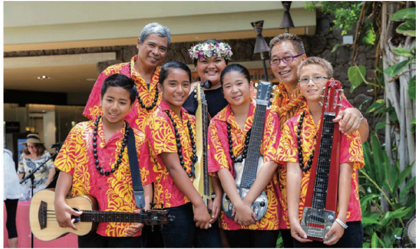
NextGen Steel Guitarists and Musicians

For the complete line-up and additional information, visit www.royalhawaiiancenter.com/events .