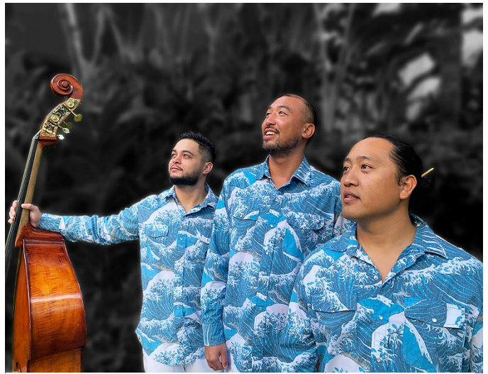
Mele Hali'a on February 19 features the Hawaiian music trio, Ei Nei.

Begin with a visit to the <u>Open Market</u> that takes place every Monday from 4:00 p.m. - 8:00 p.m . on our plaza lawn. Not only is it a great way to support local businesses, but you can also find truly one-of-a-kind souvenirs, handmade art, and snacks to take home for yourself or to give someone special this Valentine's Day.