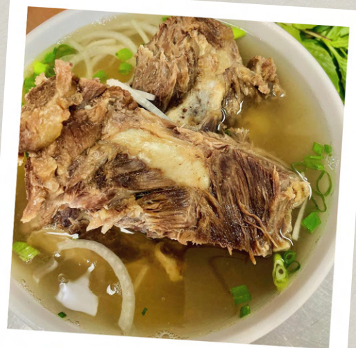
Ribs & Broth Waikiki