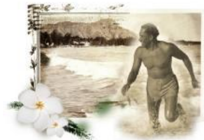
OUTRIGGER DUKE KAHANAMOKU FOUNDATION

Sunday, August 14 & 28: 9:00AM-4:00PM, Na Hula Festival (Kapi'olani Park Bandstand); 2:00PM-3:00PM, Royal Hawaiian Band performs (Kapi'olani Park Bandstand).