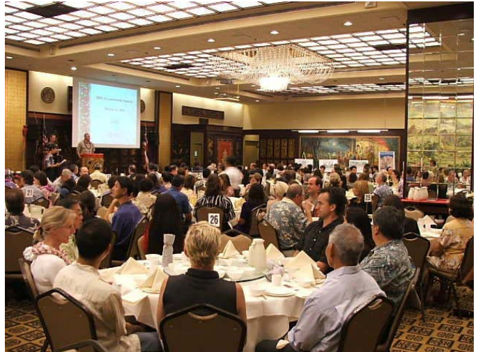
Members and guests enjoy the presentations and fine Chinese cuisine of the Lau Yee Chai at the 2005 Annual Meeting.

All of WIA's members, friends and associates are invited! See the flyer in this issue or call 923-1094 for more information.