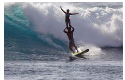
Surfing photo by Hawaiianwatershot.com